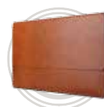
Yoga 920 Leather Sleeve